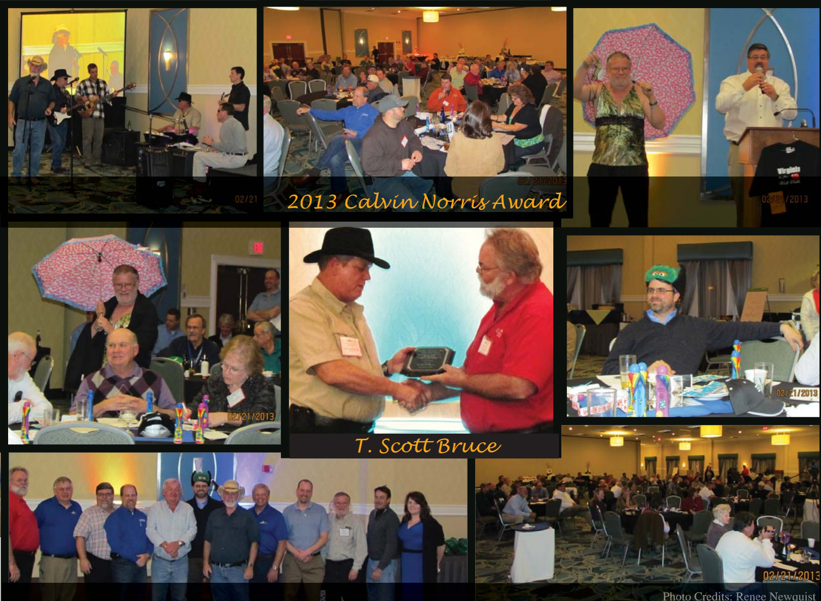
2013 Calvin Norris Award