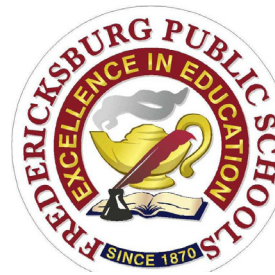
PROJECTED COURSE SCHEDULE