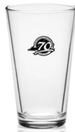
Example Memorabilia Glass

(UNLIMITED AVAILABLE, ESTIMATED DINNER EXPENSE $14,000)